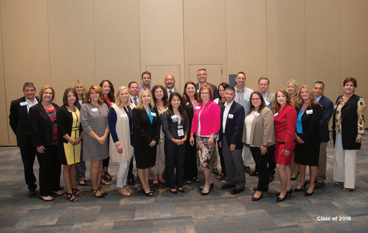
Class of 2016