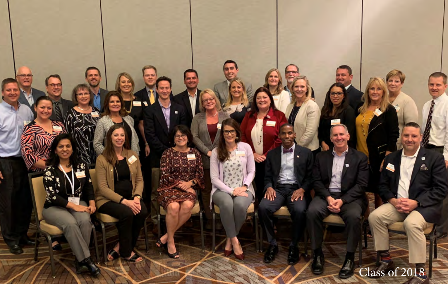
Class of 2018