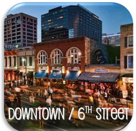
DOWNTOWN / 6 TH STREET